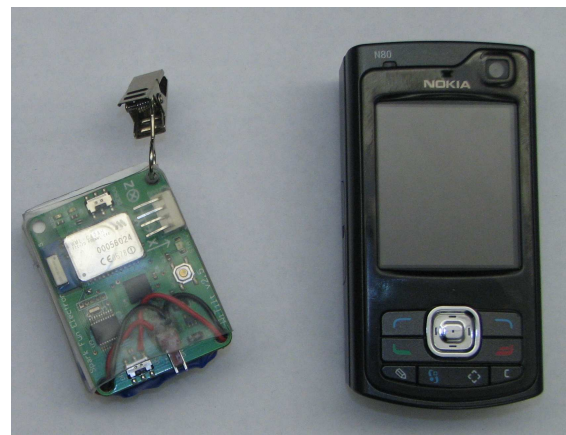
Figure 3: Our prototype key ring sensor attachment provides a GPS receiver and a 3-axis accelerometer.

We plan to expand our current focus on consumer-driven social networking, and apply CenceMe technology to public health initiatives, domain specific sensing (e.g., skiing [2], cycling [3]) and supporting logistics and production line efficiency in the commercial setting.