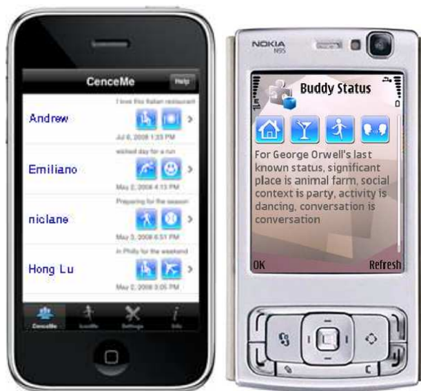
(a) CenceMe Apple iPhone client. (b) CenceMe Nokia N95 client.

CenceMe users install a sensing client on their phone that pipes data sampled from the available sensors on the phone through classifiers [4] to produce facts about the user. Facts